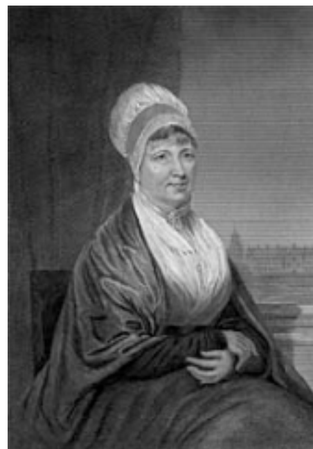
Photograph from Wikipedia

From the Hackney Society Publication "Famous Women of Hackney"