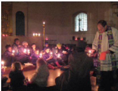
Christingle

There will be plenty of opportunity to discuss these various developments over the coming months, but let's be certain, Jesus is very much alive and well at St John-at-Hackney. At the heart of all these developments however is worship, and our worship holds the key to our wider life in the community. Thank you for your prayers. Now we watch for the answers.