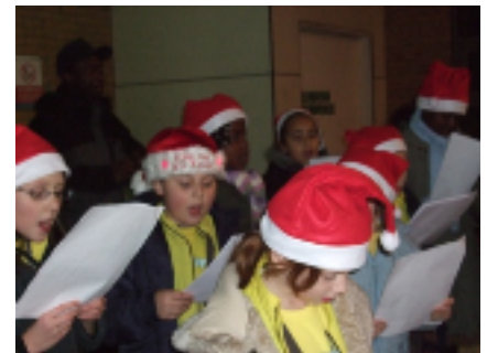
Brownies at the Homerton

New Year. The Explorer Scouts took themselves to the Comedy evening at the Hackney Empire - they said it was hilarious. They are planning to go hiking in the Lake District in 2009. The Brownies' carol singing at the Homerton Hospital went well.